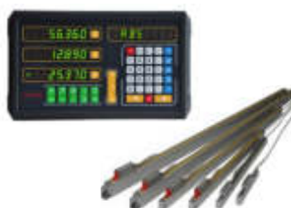
DIGITAL READOUT (Pg. No. 19)