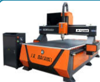
CNC WOOD ROUTER (Pg. No. 17)