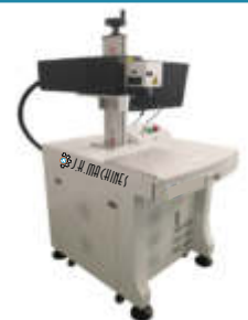
LASER MARKING/ENGRAVING (Pg. No. 14)