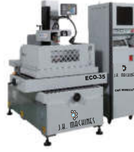
CNC WIRE CUT DC STEPPER (Pg. No. 09)