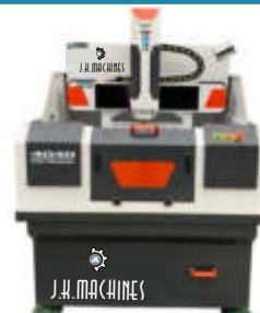
CNC ENGRAVING (Pg. No. 15)