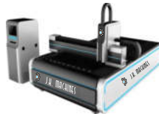
FIBER LASER CUTTING (Pg. No. 13)