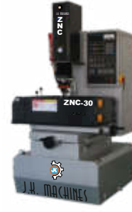
ZNC EDM DC SERVO (Pg. No. 05)